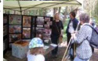
Exhibiting at the Secret Wood event in Raincliffe Woods

A claim has been lodged with the Administrator.